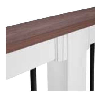
Traditional (Available in double aluminum and 42")