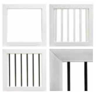
Custom Welded Gates