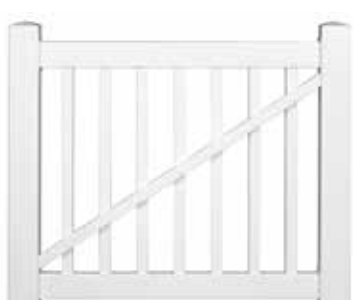
36"W x 36"H Trimmable Adjustable Gate Kit (Assembly Required)