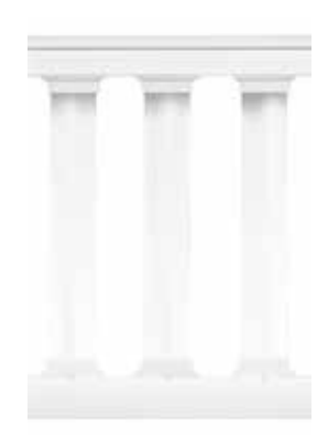
Scenic Clear View Glass